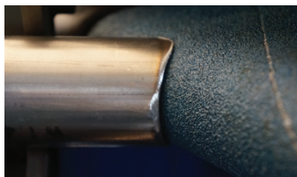
Dettaglio lavoro macchina Machine work detail