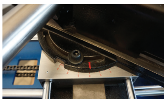
Disco graduato Graduated disc